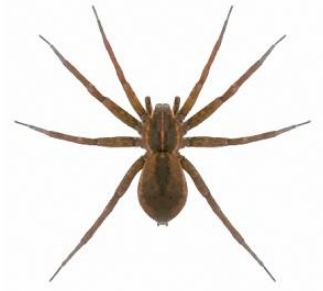
Giant Water Spider