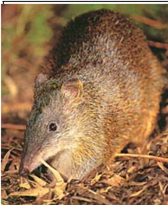
Northern Brown Bandicoot