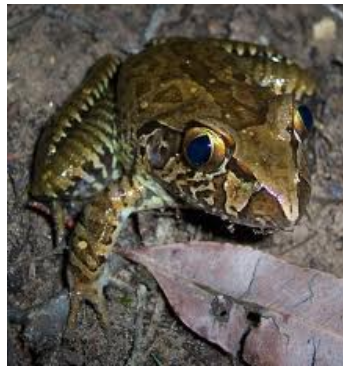
Giant Barred Frog